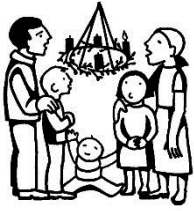
O come, O come Emmanuel

“John was clothed in camel’s hair, with a leather belt around his waist. He fed on locusts and wild honey.”